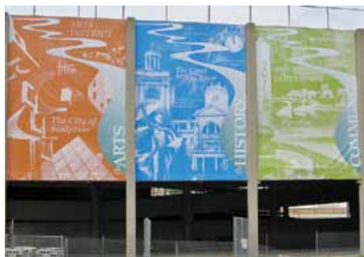
HCF also funded the new banners on the city parking garage, along with the SID and City of Sculpture. Downtown revitalization continues to be an important focus area in the Foundation's strategic plan.

The Foundation currently administers more than 529 charitable funds. For more information on our grant cycle, visit our website at http://hamiltonfoundation.org/grantHowToApply.asp