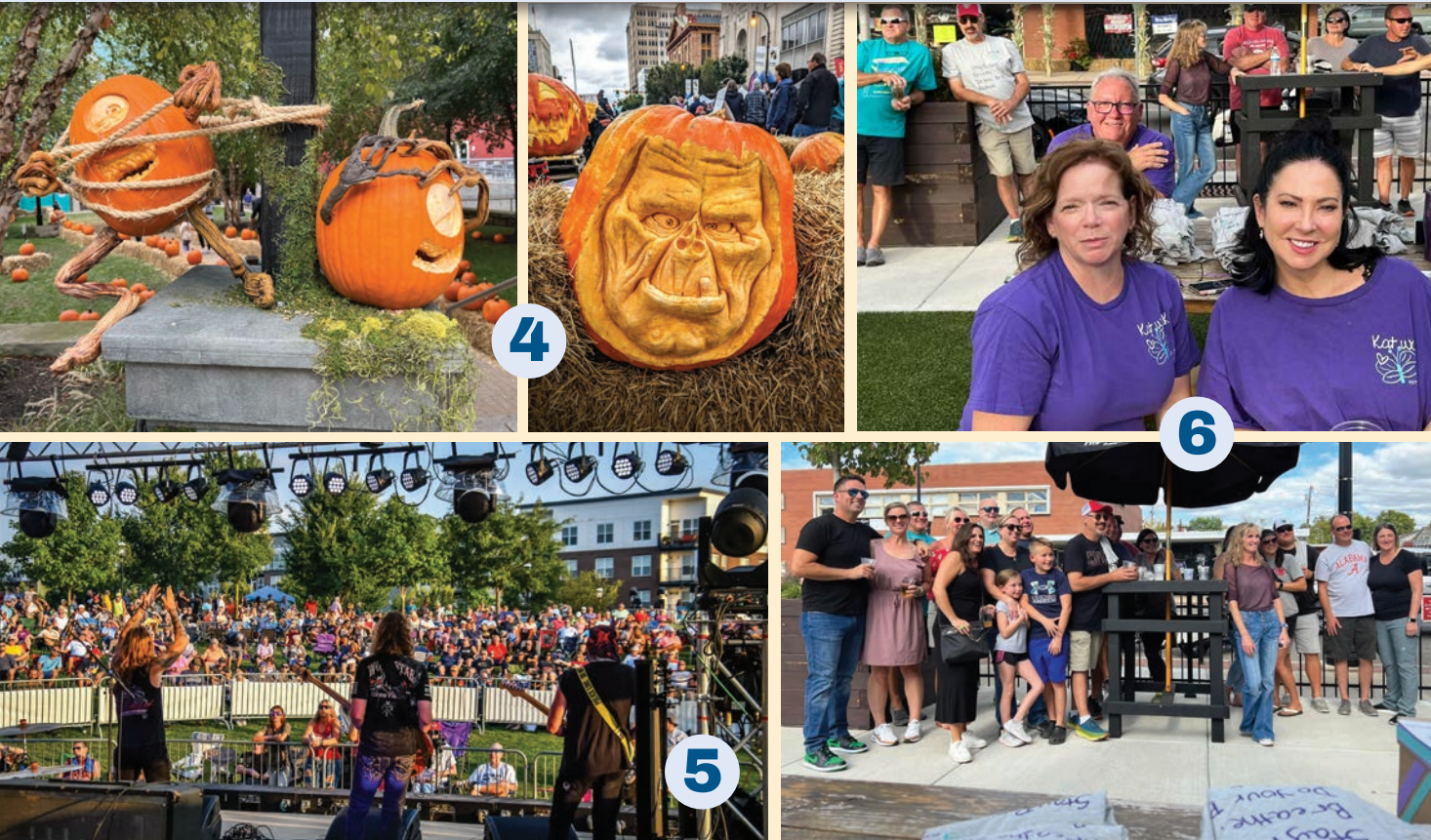
4.Operation Pumpkin 5.RiversEdge 6.Kat Walk for Katherine Schindler Memorial Fund

First Financial Foundation has been making grants for years in multiple communities and states. By establishing the First Financial Bank Fund they are laying the foundation for support in the local community.